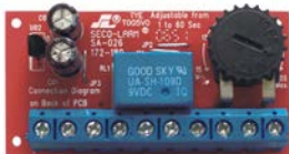
SA-026Q Miniature Timer Module