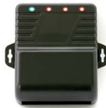
SA-025EQ Delayed Egress Timer