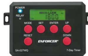
SA-027WQ 7-Day Timer