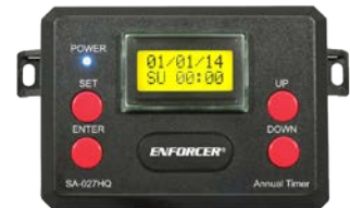
SA-027HQ 365-Day Annual Timer